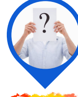
You can be the next

"As you take the next big step, remember that we are with you in your every step of the way"